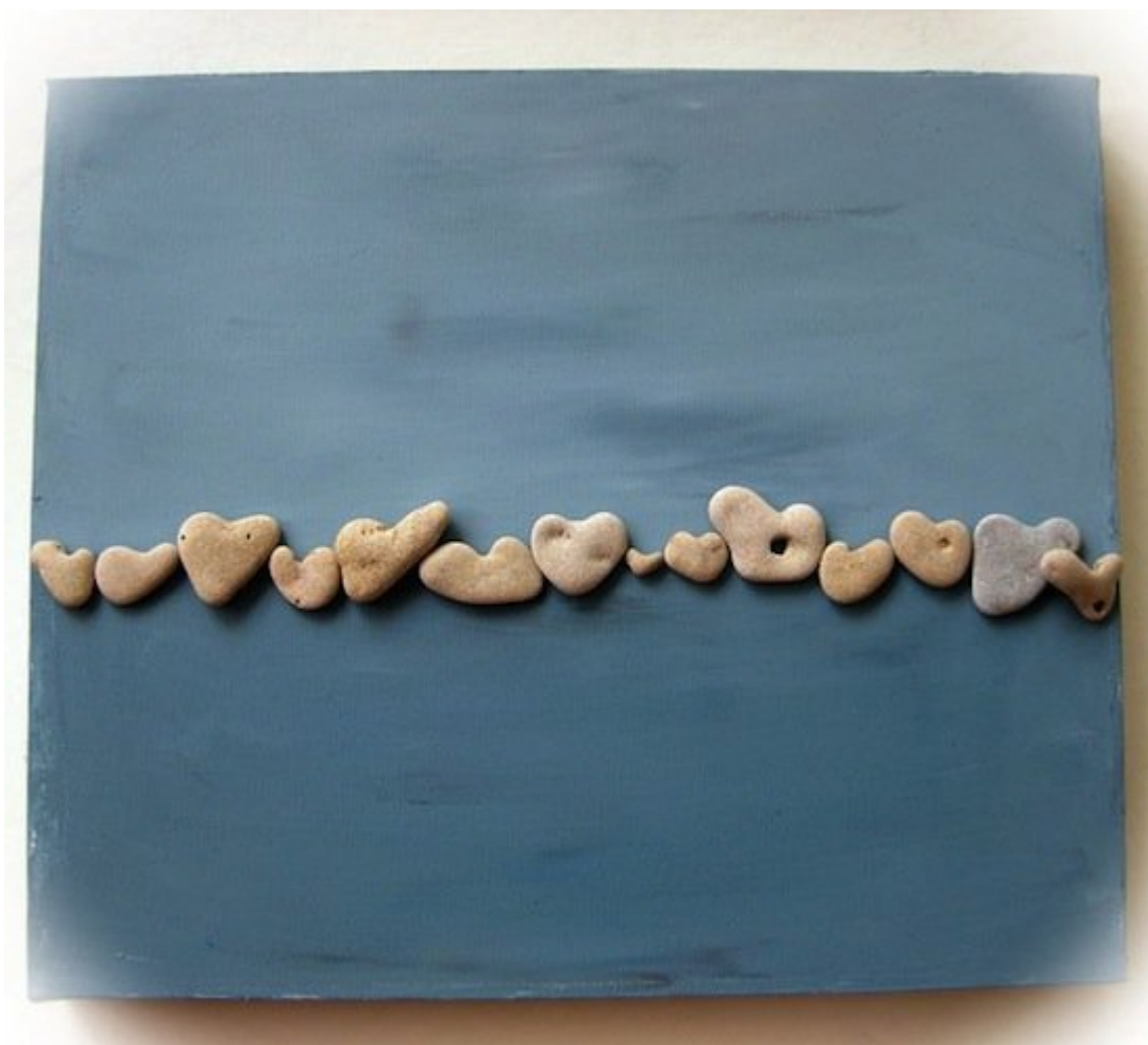
crazinesssues.wordpressGet creative using pebbles.