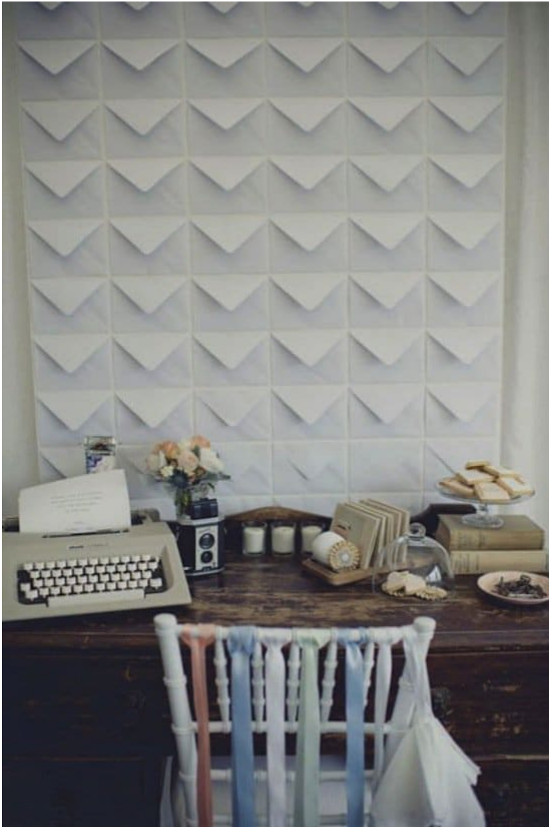
Envelopes can add a layer of interest to a wall.